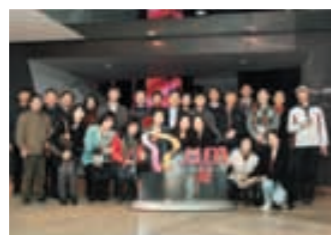
Visit to Industrial Site