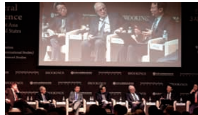
China-US-ROK Trilateral Conference

From 2013 to 2015, KFAS invited eighteen leading Korean experts on China to KFAS headquarters to give monthly lectures as part of the China Lecture Series . Lectures were given on various top-