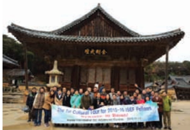
First Cultural Tour for 2015-2016 ISEF Fellows

• VIETNAM Vietnam National University, Hanoi Asia Research Center Room No. 504, 5th Fl., Headquarter Bld. 144 Xuan Thuy Rd., Cau Giay District Hanoi, Vietnam T. 844-37547987 E. arc@vnu.edu.vn