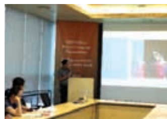
Korean Language Presentation