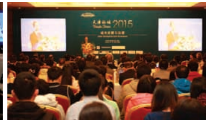
2015 Tianjin Forum

KFAS and Yanbian University began co-hosting the Tumen River Forum in 2008, inviting scholars and experts from China, South Korea, North Korea, Japan, Russia, and the United States to discuss regional issues such as the development of the Tumen River area. The overarching theme of the forum is “Multicultural Coexistence and Win-win Cooperation.”