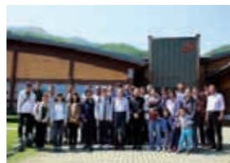
Visit to Afforestation Plant