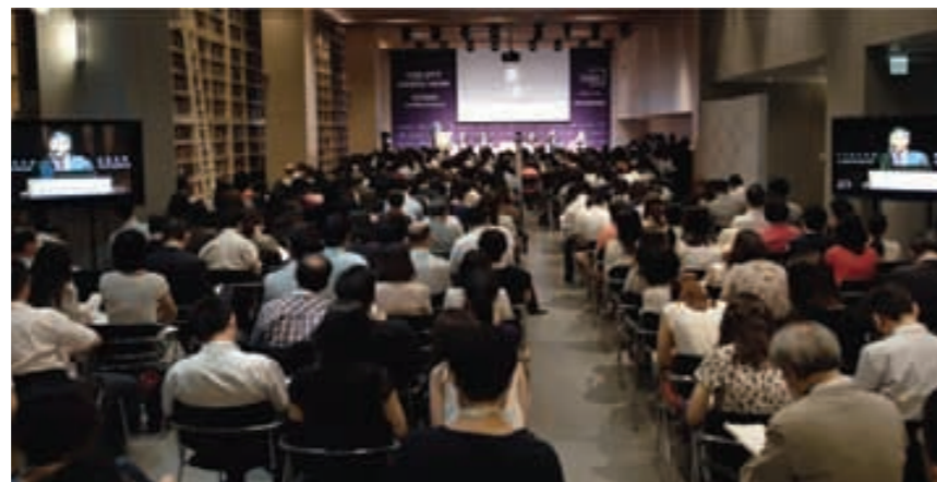
KFAS Conference Hall