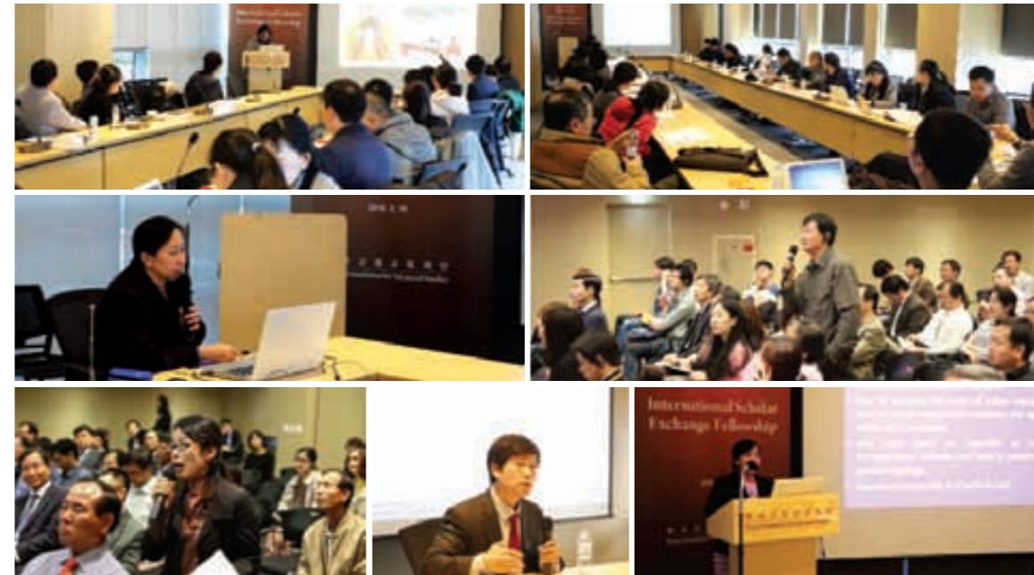
Academic seminars by ISEF fellows

dations. You may download the form at the KFAS homepage. (“Community” → “Download” → “Letter of Recommendation.doc”)