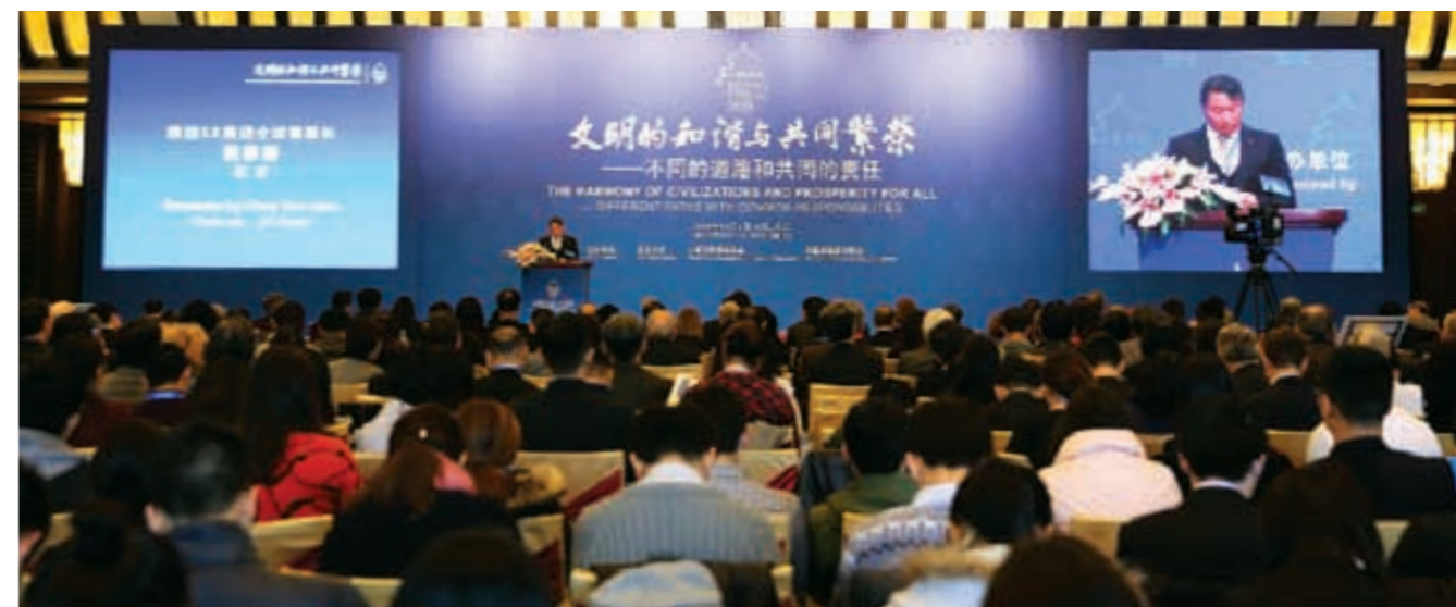
2015 Beijing Forum

The International Conference on Southeast Asian Cultural Values has been co-hosted annually by KFAS and the Royal Academy of Cambodia (RAC) since 2005. Over the years, the conference has focused on the following critical themes: “Preservation and Promotion of Culture” (2005), “Exchange and Cooperation” (2006), “Pro-