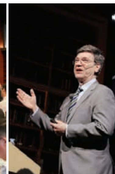
Special Lecture by Prof. Jeffrey D. Sachs