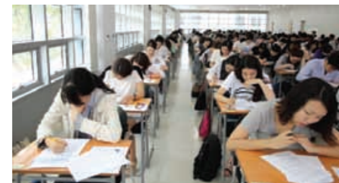
Scholarship Program Exam