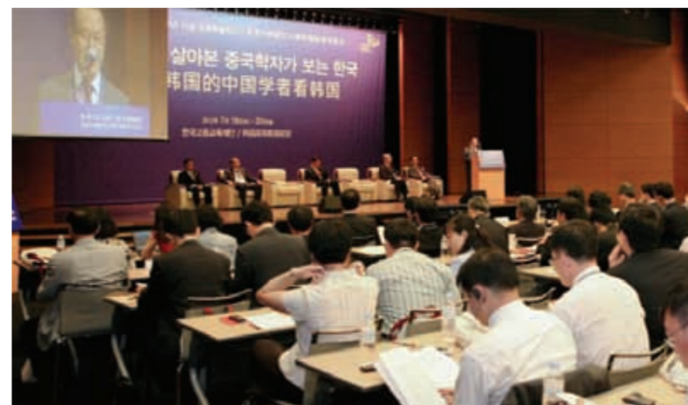
International Conference Commemorating 20 Years of Korea-China Diplomatic Relations