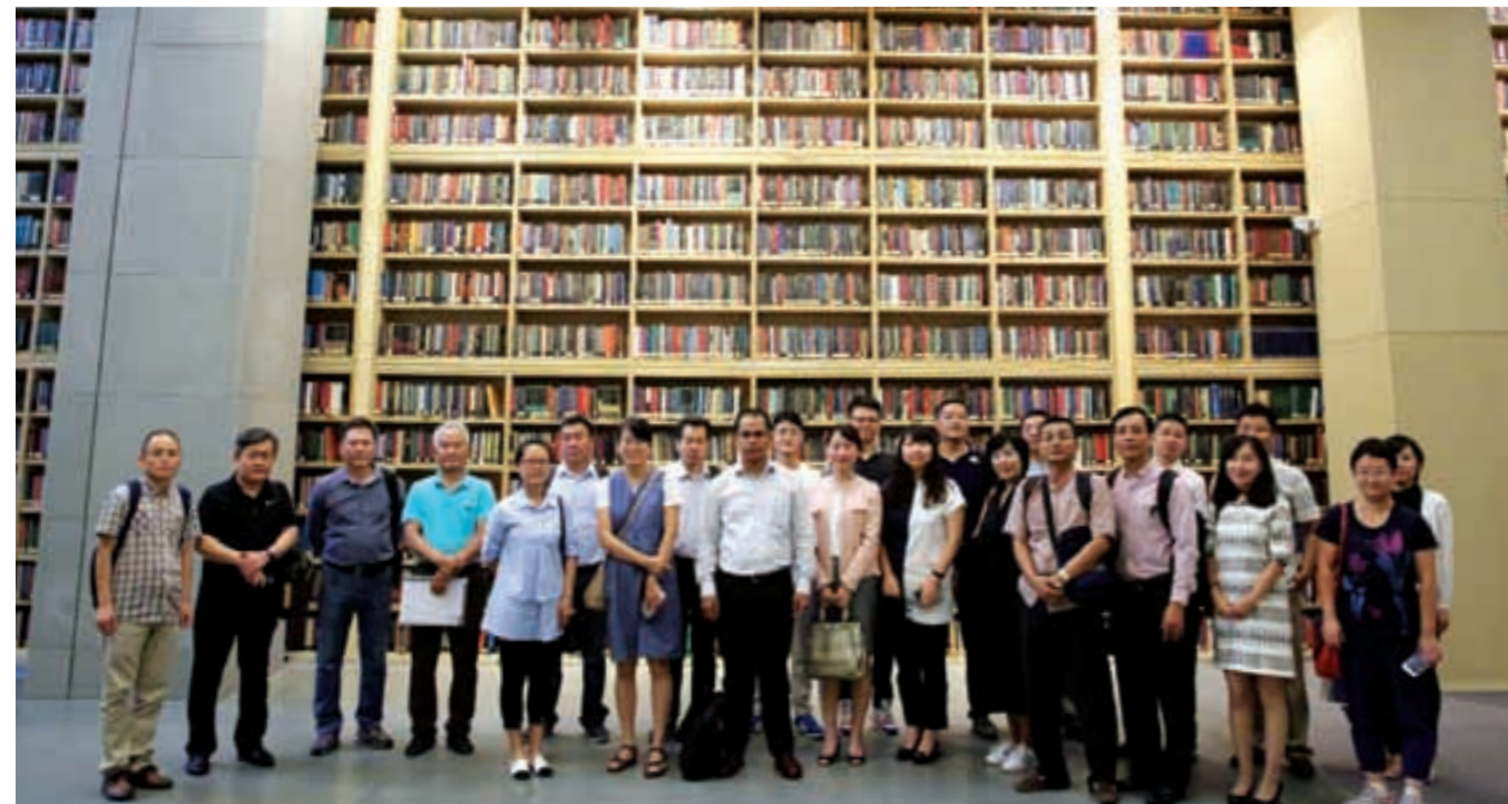
2016-2017 ISEF Fellows in the Conference Hall, upon arrival at KFAS

KFAS invites prominent scholars from Asia and the Middle