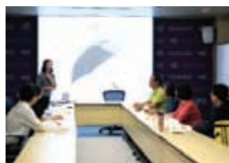
Korean Language Class