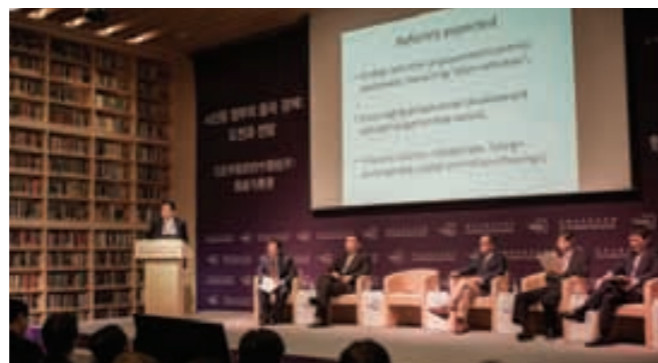
Understanding China Conference