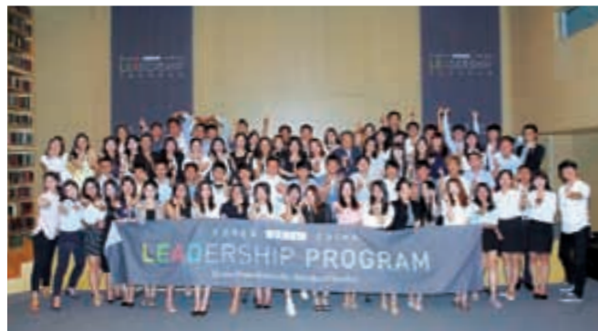
Korea-China LEADership Program

alumni who are prominent university professors and researchers have volunteered their services as of now.