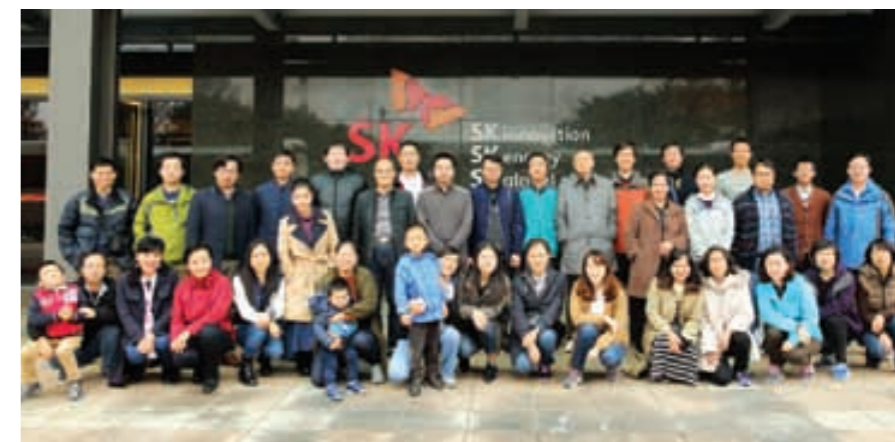
SK Energy Ulsan Complex Visit