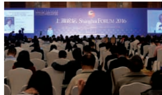
2016 Shanghai Forum