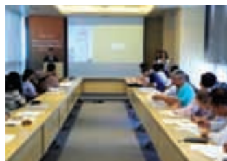
Orientation for the ISEF Fellows