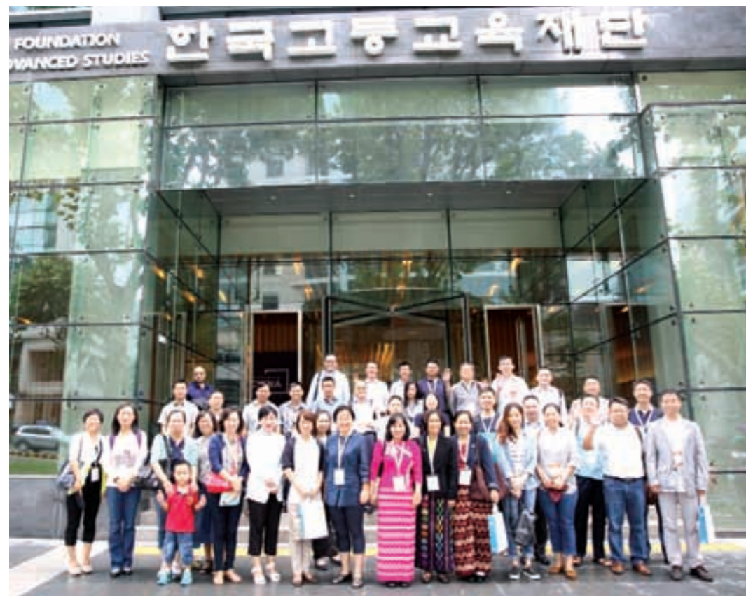
Arrival of 2015-2016 ISEF Fellows at KFAS

KFAS invites prominent scholars from Asia and the Middle East in the fields of humanities, social sciences, petrochemical engineering, electrical