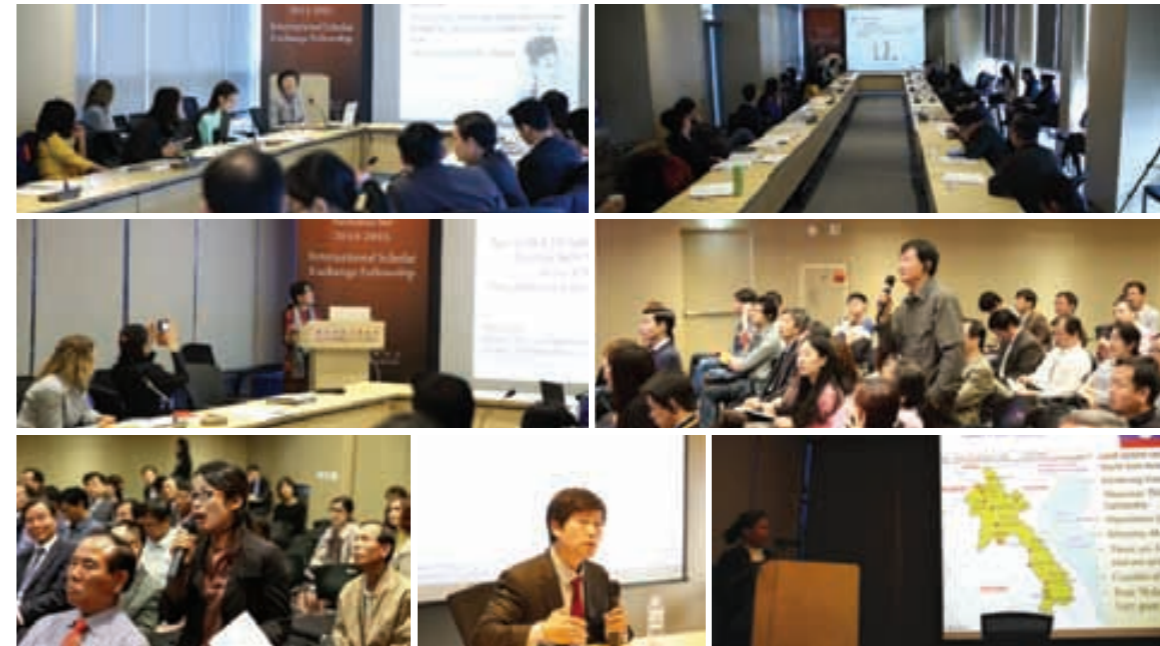
Academic seminars by ISEF fellows

dations. You may download the form at the KFAS homepage. (“Community” → “Download” → “Letter of Recommendation.doc”)