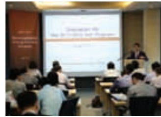
Orientation for the ISEF Fellows

Introduction to Korea Foundation for Advanced Studies 1