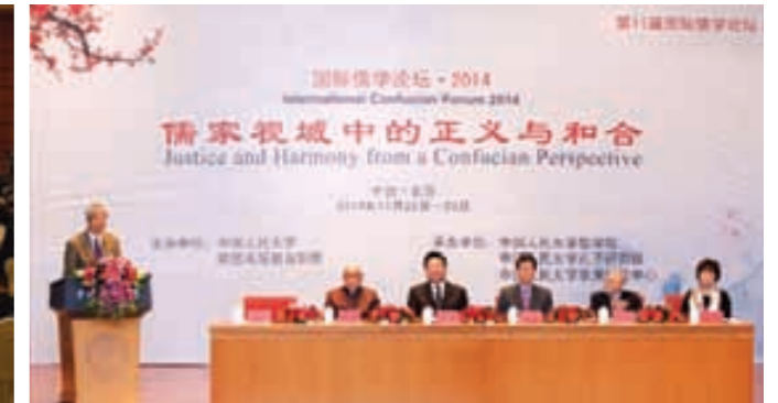
International Confucian Forum 2014

KFAS and Yanbian University began co-hosting the Tumen River Forum in 2008, inviting scholars and experts from China, South Korea, North Korea, Japan, Russia, and the United States to discuss regional issues such as the development of the Tumen River