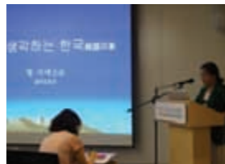
Korean Language Presentation