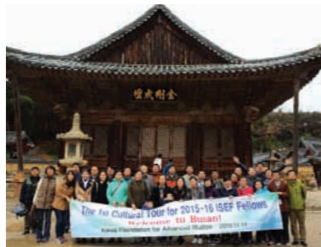
First Cultural Tour for 2015-2016 ISEF Fellows

•Vietnam Vietnam National University, Hanoi Asia Research Center Room No. 504, 5th Fl., Headquarter Bld. 144 Xuan Thuy Rd., Cau Giay District Hanoi, Vietnam T. 844-37547987 E. arc@vnu.edu.vn