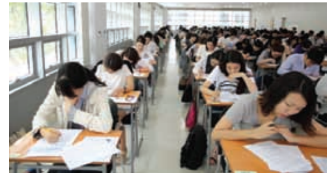
Scholarship Program Exam