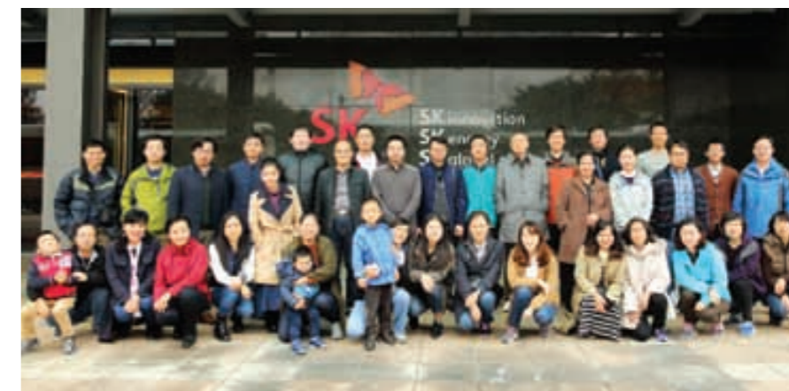
SK Energy Ulsan Complex Visit