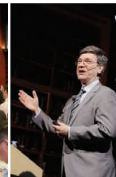
Special Lecture by Prof. Jeffrey D. Sachs