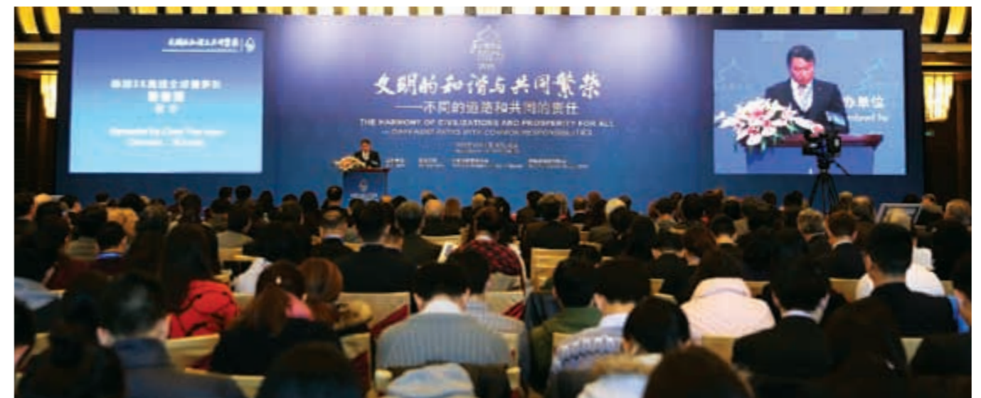
2015 Beijing Forum

The International Conference on Southeast Asian Cultural Values has been co-hosted annually by KFAS and the Royal Academy of