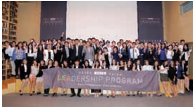
Korea-China LEADership Program

alumni who are prominent university professors and researchers have volunteered their services as of now.