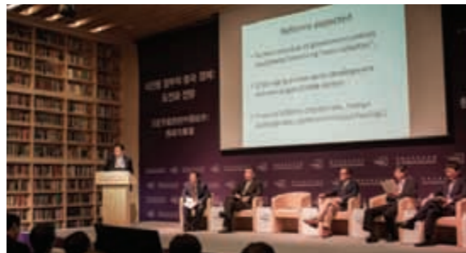
Understanding China Conference