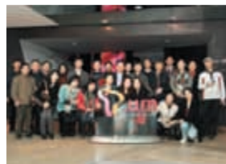
Visit to Industrial Site