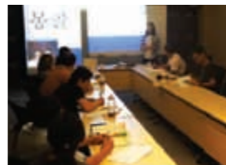
Korean Language Class

Information of International Scholar Exchange Fellowship 2016-2017 8