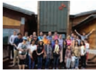
Visit to Afforestation Plant