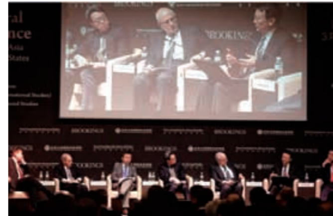
China-US-ROK Trilateral Conference