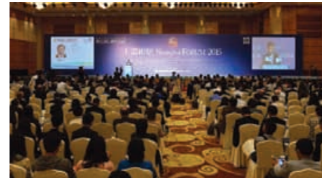
2015 Shanghai Forum